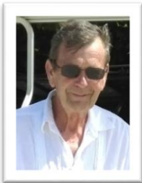
Harlan Donaldson Racing Competition

2. What is/are your DMVR interests? I like solo. I started PDX/CRY this year and am a worker.