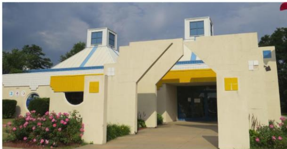
National Balloon Museum - Indianola