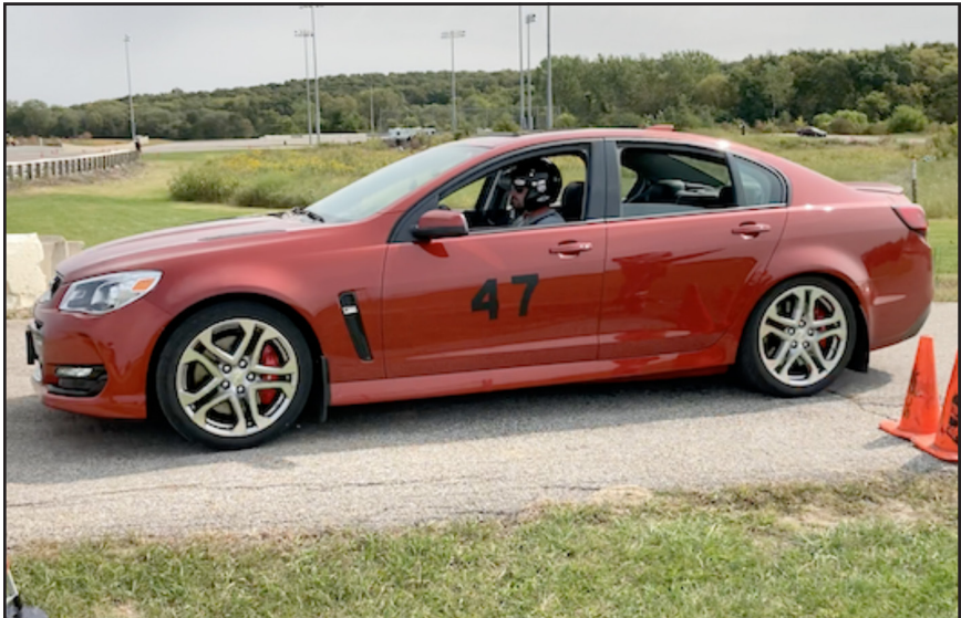
Launching the SS at Eddyville!

Oh, very cool. So, what came after the 300ZX?