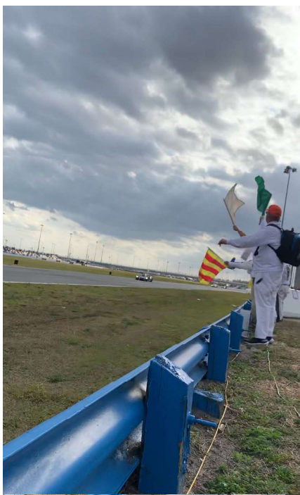
F&C Marshalls saluting the overall winner of the 2021 Rolex 24 at Daytona